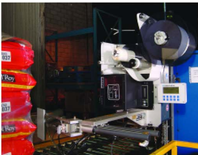
The Label-Aire printer/applicator was customized to properly affix labels on the pallets shipped from the Nestlé Purina plant.