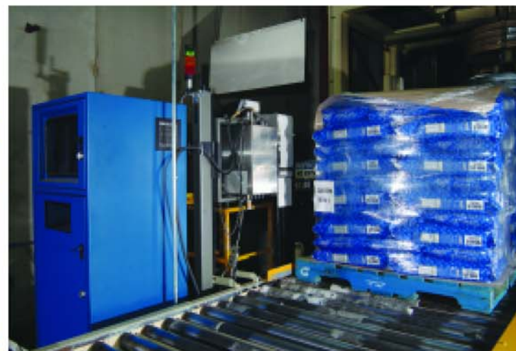
A PC is in place on the labelling system as plans are in the works to further integrate the system with the plant's warehouse management system (WMS).

installation of a 3138-N Dual Action Tamp Printer labeling machine manufactured by Fullerton, Ca.-based Label-Aire Inc. , the labeling machinery arm of industrial equipment group Impaxx, Inc. of Fullerton, Ca.